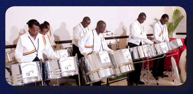
The Ready Panners provided entertainment well-appreciated by the audience.