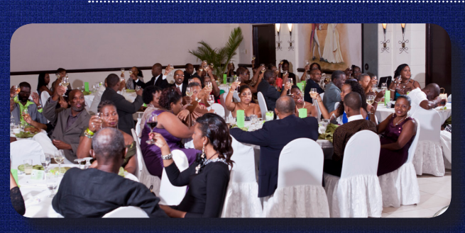
Attendees enjoying a toast